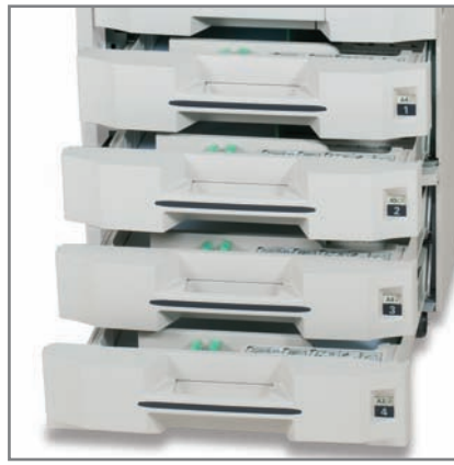
4 UNIVERSAL CASSETTES for a maximum paper capacity of 2,200 sheets