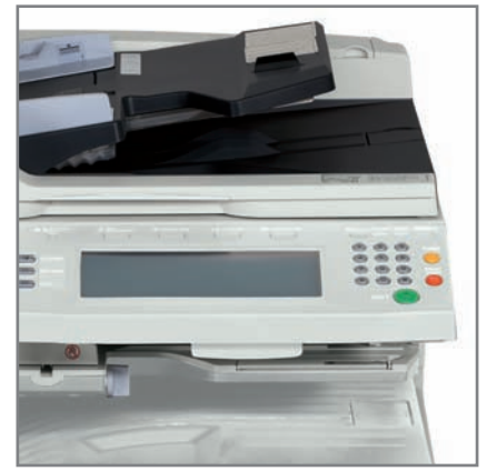
ADJUSTABLE TOUCH-SCREEN PANEL with intuitive menu