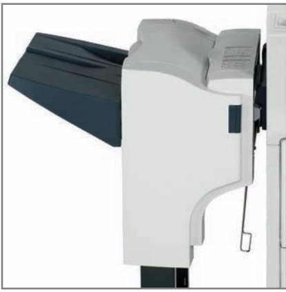
DF-730 FINISHER with a 1,000-sheet output capacity tray