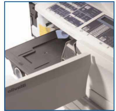
Long-life TONER CARTRIDGE (up to 15,000 A4 pages with 6% coverage)