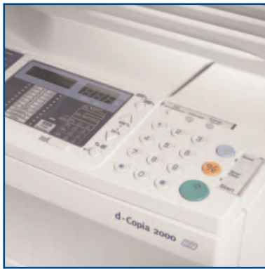
Easy-to-use OPERATOR PANEL for quick access to all digital functions